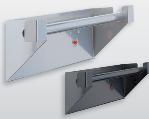
Holder for roll paper core-Ø min. 22 mm, max. roll width 295 mm