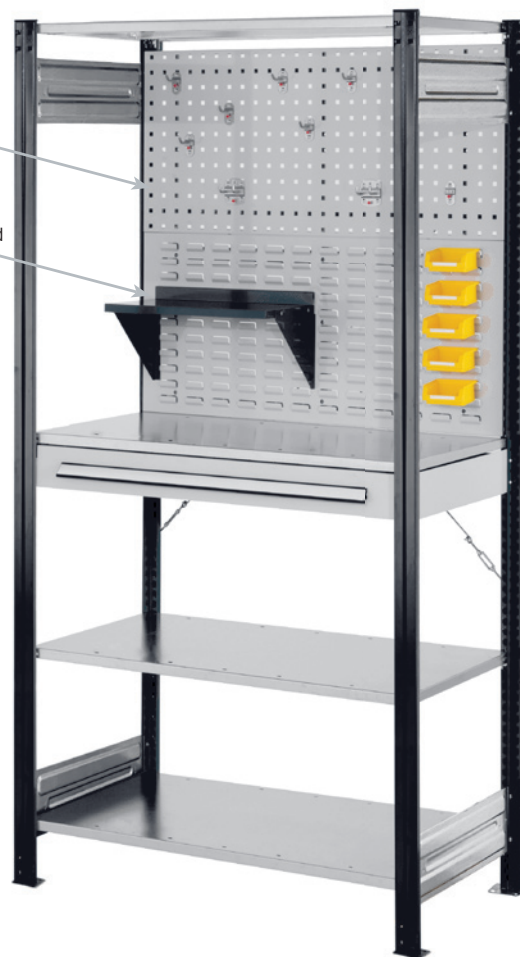
®RasterPlan Tool Board H 450 x W 1000 mm