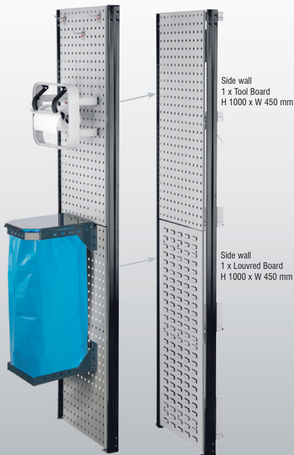
Side wall 1 x Tool Board H 1000 x W 450 mm