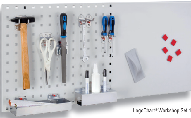
LogoChart® Workshop Set 1