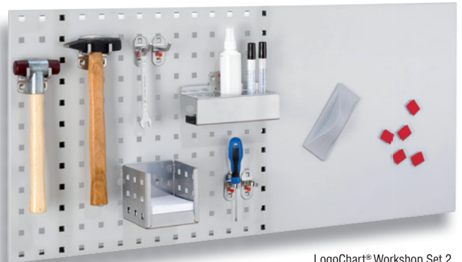
LogoChart® Workshop Set 2