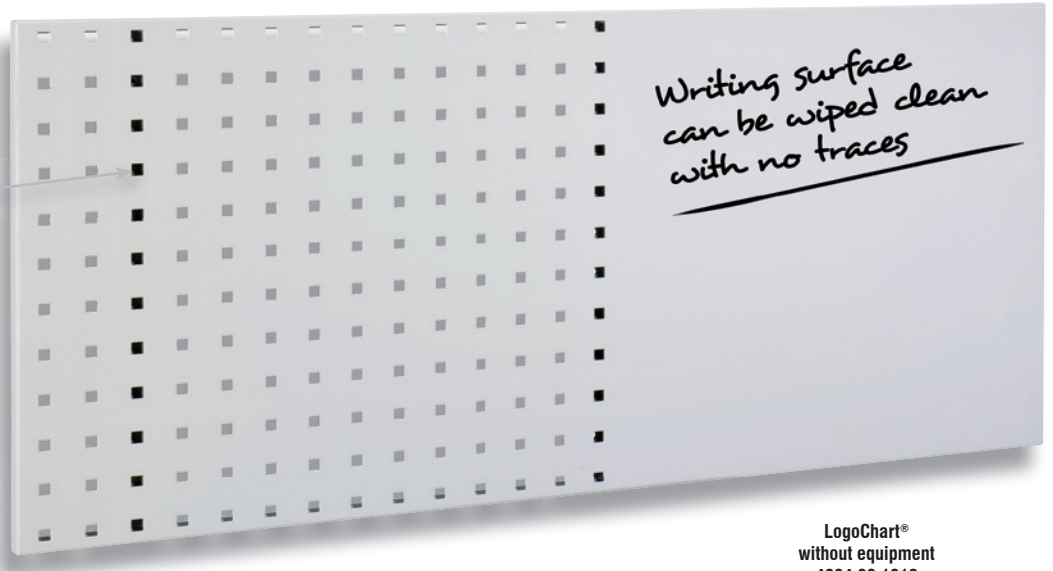
LogoChart® without equipment 4604.00.1013

Construction of the backside LogoChart® are stiffened by special designed joists, both sides welded on for highest load.