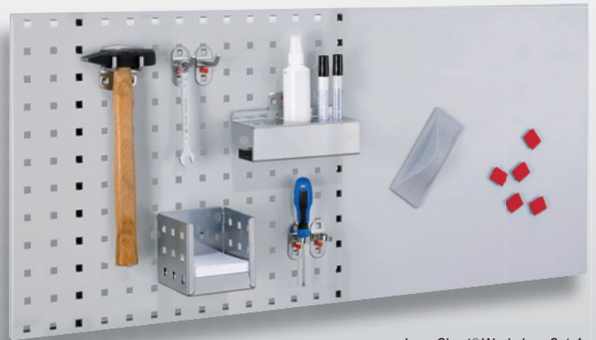
LogoChart® Workshop Set 4