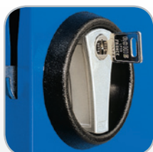
Three bolt security barrel lock with sunk turning handle

Doors and drawers available in two Colors