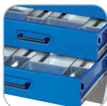
Drawers on telescopic rail slides with stamped drawer bottoms