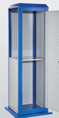
® RasterPlan ToolTower