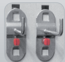
Key Holder with vertical hook end, galvanized 4040.00.0905