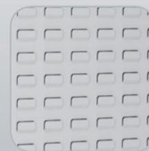
Vertical pull-out on both sides with Louvred Boards